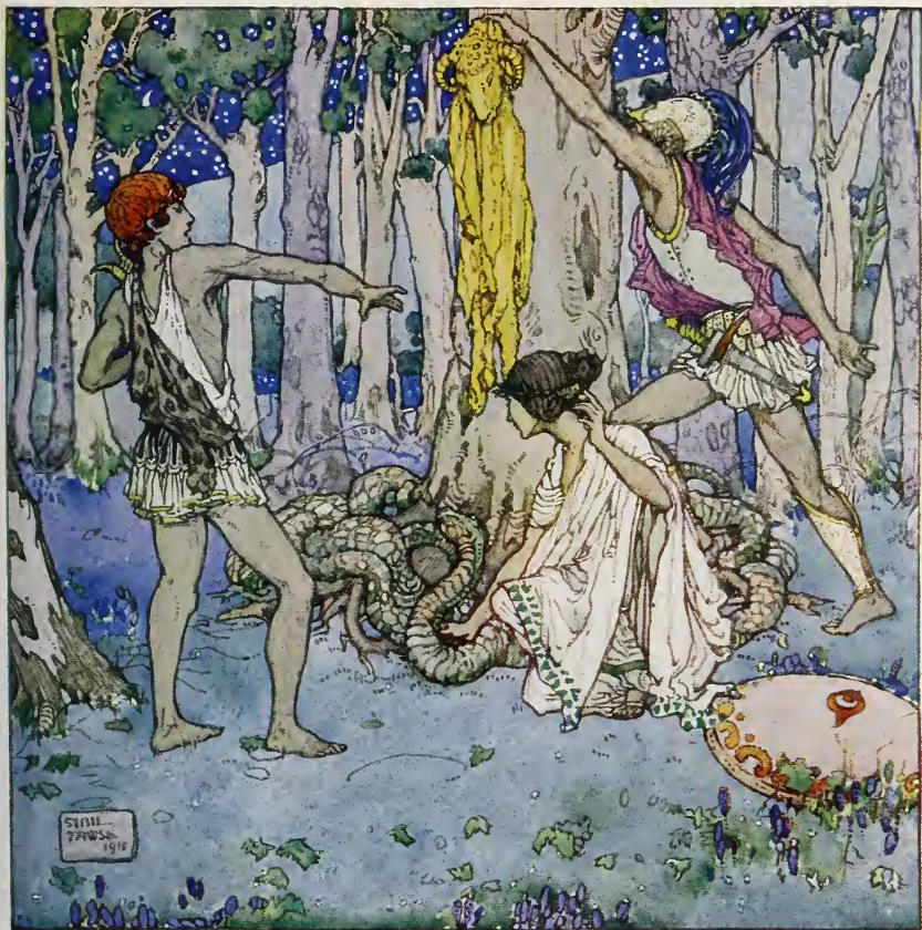
THE GOLDEN FLEECE